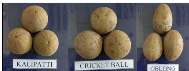
Plate 2.1: Fruits of sapota varieties kalipatti, cricket ball and oblong

The respiration rate of sapota varieties clearly indicates lower rate of CO 2 production during initial days and subsequent increase in respiration upto 4 th day was observed. Initially the respiration rate was 46.23, 49.51 and 50.10 mL CO 2 /kg/h in case of kalipatti, cricket ball and oblong respectively. The respiratory peak was observed on 4 th day with respiration rate of kalipatti (69.89 mL CO 2 /kg/h), cricket ball (74.67 mL CO 2 /kg/h) and 78.78 mL CO 2 /kg/h in case of oblong (Figure 1). The respiration rate was significantly lesser in case of kalipatti variety of sapota as compared to other two varieties. Rate of change in respiration rate in case of kalipatti, cricket ball and oblong variety during the 8 days storage period was 6.913%, 7.513% and 8.011% respectively. Respiration rate was positively correlated with the titratable acidity, ascorbic acid, ethylene evolution and negatively correlated with total soluble solids in all the three varieties during the storage period of 8 days. Our findings are in consonance with Bhutia et al. (2011) [3]; Moo-Huchin et al. (2013) [6]. Bhutia et al. (2011) [3] reported that the respiration rate of sapota cv. kalipatti as (72.0 mL CO 2 /kg/h) on 3 rd day of storage.