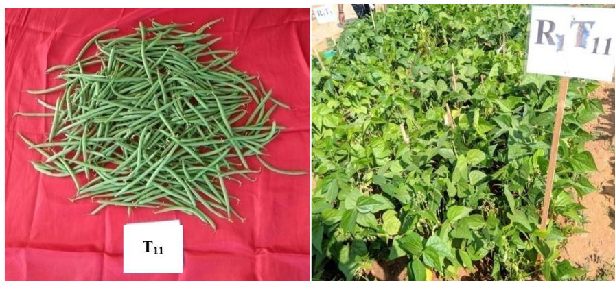
Fig 1: Pod yield from sample plant in T11 (Left), plant growth in T11 (Right)

(106.7 g) which was significantly superior than rest other treatments of the experiment followed by T9 (102.8g) and T6 (100.7 g) which remains at par. However, lowest yield plant-1 was recorded in T1 (46.0 g) which is significantly inferior to all other treatments.