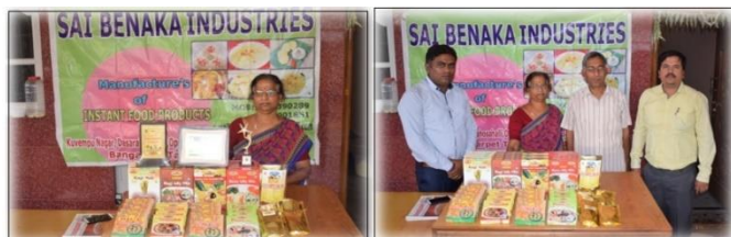
Fig 2: Display of R –T- C value added products