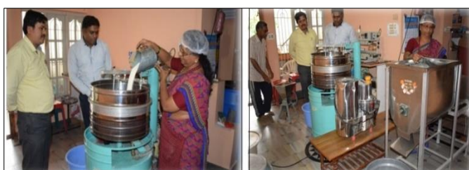
Fig 3: Processing Unit at S. G. Kote Village, Bangarpet