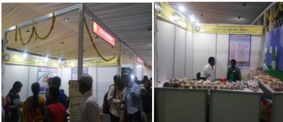
Fig 5: Display and sale of R-T-C products at International Minor Mela at Palace Ground, Bengaluru