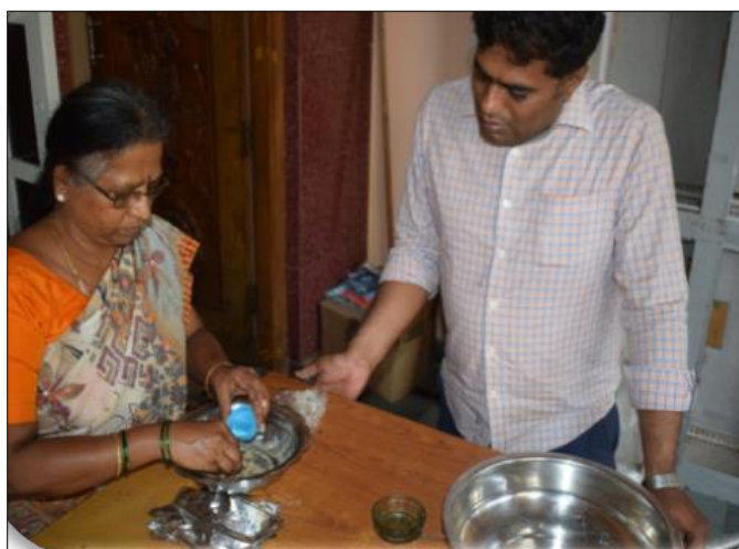
Fig 1: Vocational Training programme conducted at ICAR-KVK, Kolar