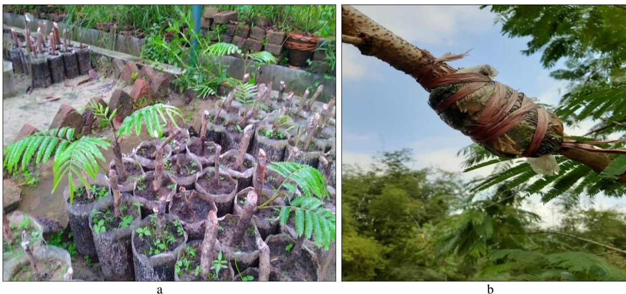
Fig 3: Propagation of P. timoriana through a.) Stem cuttings & b.) Air-layering in RFRI Jorhat campus.