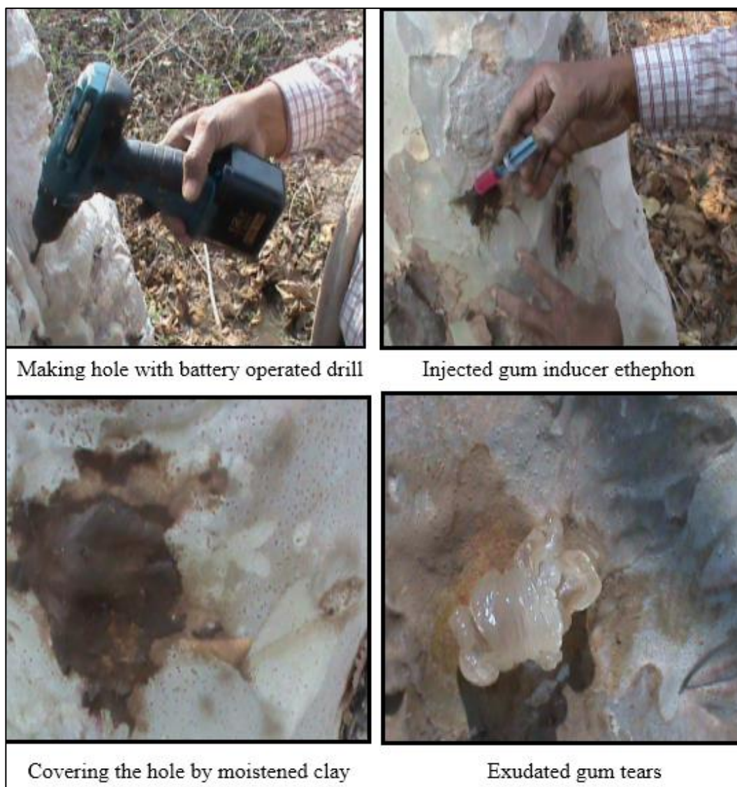
Plate 1: (c) Chemical tapping method in gum karaya tree

check variation in gum exudates per month on the basis of weight.