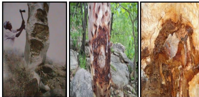
Plate 1: (b) Mechanical Tapping method in Gum karaya tree