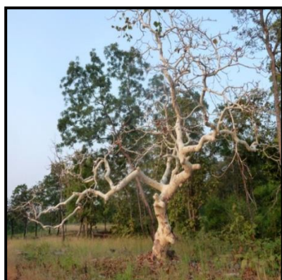
Plate 1: (a) Gum Karaya tree

The gum yield increase with increase in concentration of ethephon. Indole-3-acetic acid (IAA, 3-IAA) is the most common, naturally-occurring, plant hormone of the auxin class. It is the best known of the auxins, and has been the subject of extensive studies by plant physiologists (Siman and Petrsek, 2011) [22]. An Application of Indole 3-acetic acid (IAA) increase the number of gum ducts in Sterculia urens (Setia and Shah, 1977a) [18] However, gum tapping using scientific methods of gum exudation not only increase the life span of the tree but also yields good quality gum of high International value (Gupta et al. , 2012) [8].