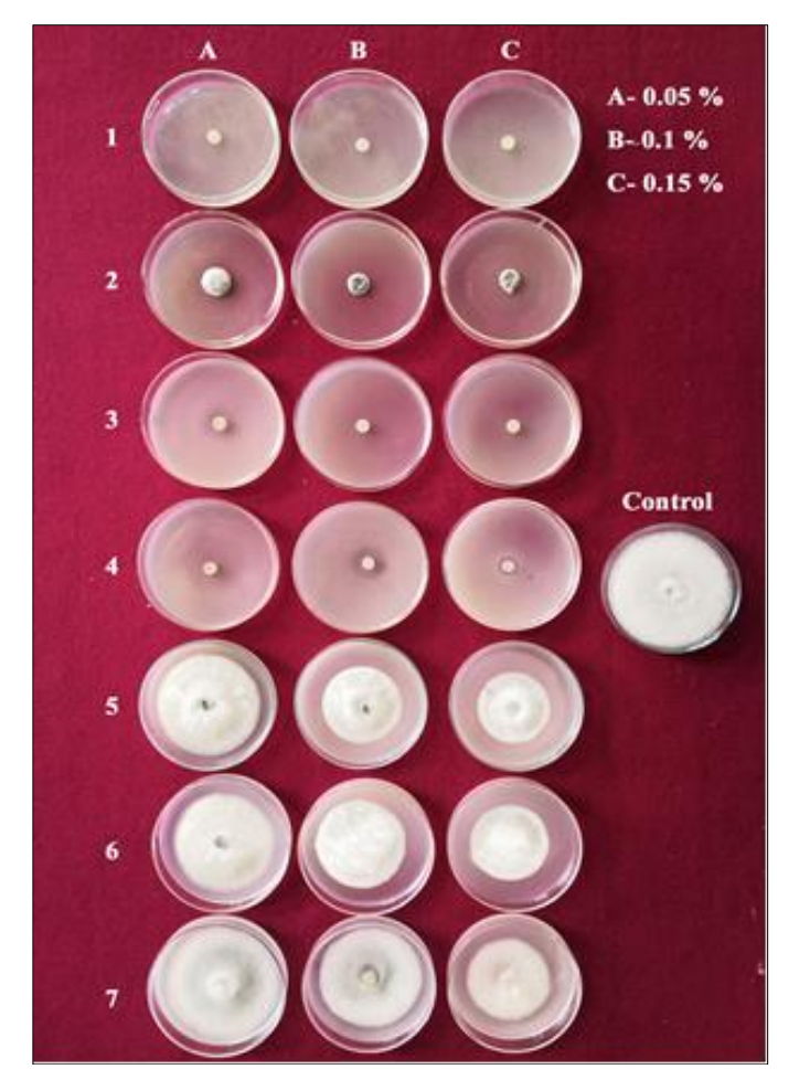
Plate 1: In vitro efficacy of systemic fungicides against C. gloeosporioides of mango

*Figures in parentheses indicate angular transformed values