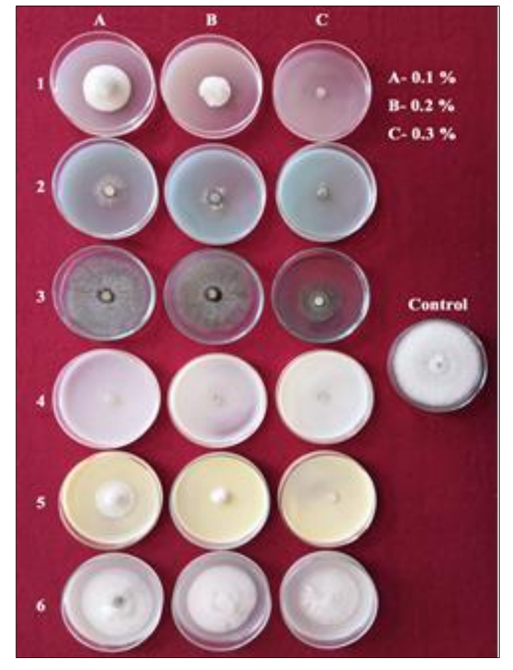
Plate 2: In vitro efficacy of non-systemic fungicides against C. gloeosporioides of mango