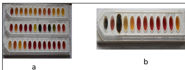
Fig 3: a) Carbohydrate utilization pattern of bacterium, b) IMViC test