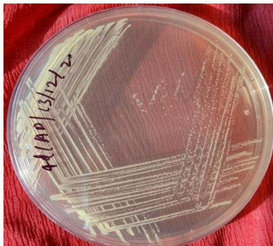
Fig 1: Morphology of bacterium 4d